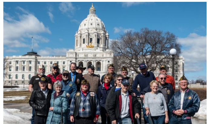
Attendees at Vets Day on the Hill