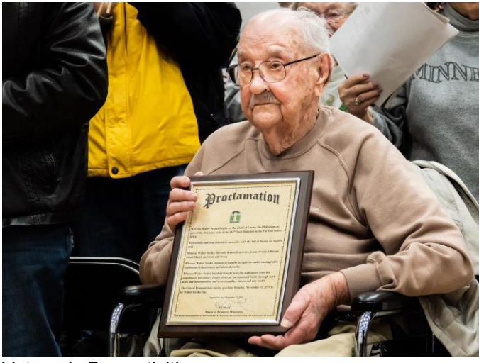
Veteran's Day activities