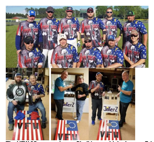
The VFW 35 year and up softball team which plays on Friday nights at Memorial field in Brainerd during the summer. Photos above are the winners from the 3 Beanbag tournanents which were held. Threre was a total of 28 participants.